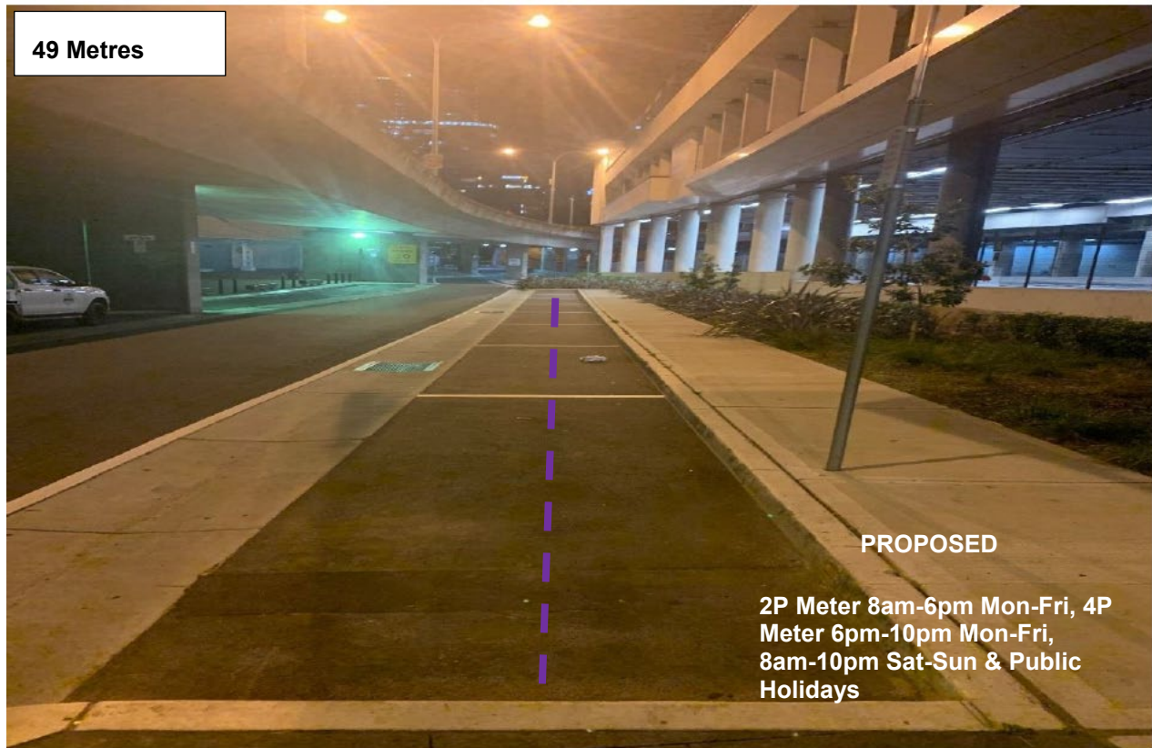
Street Level Photo